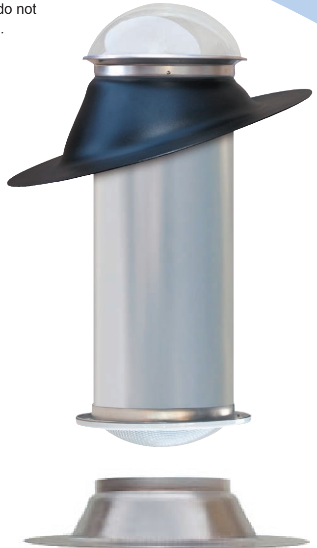
FLAT ROOF FLASHING