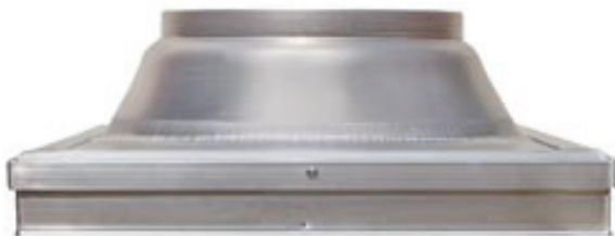
CURB MOUNT FLASHING