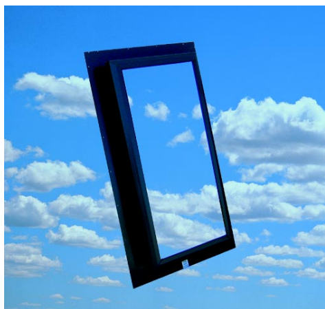
THE MARQUIS SERIES