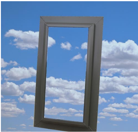
THE MARQUIS SERIES