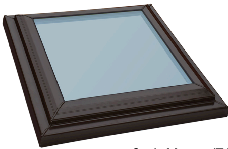
Curb Mount (TCMG)

Kennedy Skylights manufactures high performing, quality glass skylights in both curb or deck mount models to accommodate all roof pitches and roofing systems. Our energy efficient Tempered Glass Series is a great choice for warmer climates or locations that do not experience severe weather. For hurricane prone areas, upgrade to our Impact Glass Series .